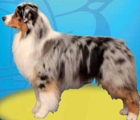
Best in Show Winner - 2023